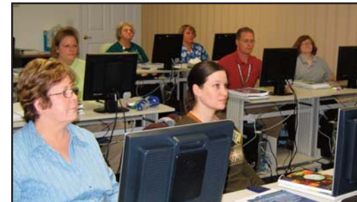
School at Work participants learn through Internet and video training.

English as a Second Language (ESL) and GED classes are offered free of charge. These classes are coordinated through the Rolla Adult Education and Literacy Program. The ability to speak and understand the English language positively impacts the wellness of the communities we serve through enhanced understanding and communication. The GED classes assist students in preparing for their General Education Development certification.