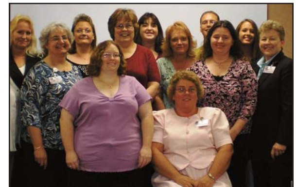
After eight months, employees graduate from the School at Work program.

English as a Second Language (ESL) and GED classes are offered free of charge. These classes are coordinated through the Rolla Adult Education and Literacy Program. The ability to speak and understand the English language positively impacts the wellness of the communities we serve through enhanced understanding and communication. The GED classes assist students in preparing for their General Education Development certification.